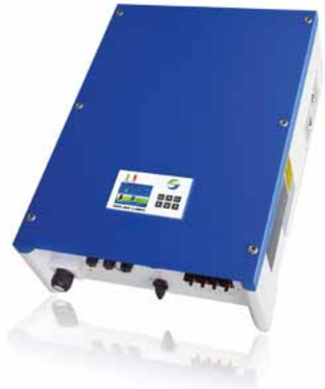
SolarLake 17000TL Efficiency