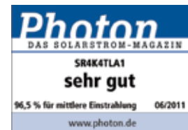
SolarRiver 1700TL Efficiency